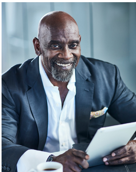
CHRIS GARDNER Author, Entrepreneur

We sat down with the CEO of Happyness to discuss the chapter of his life he’s writing right now. In preparation for his keynote presentation and book signing of “Permission to Dream” at the BFAN Symposium, we had the chance to talk with Chris about his past, his future and what’s on his mind right now.