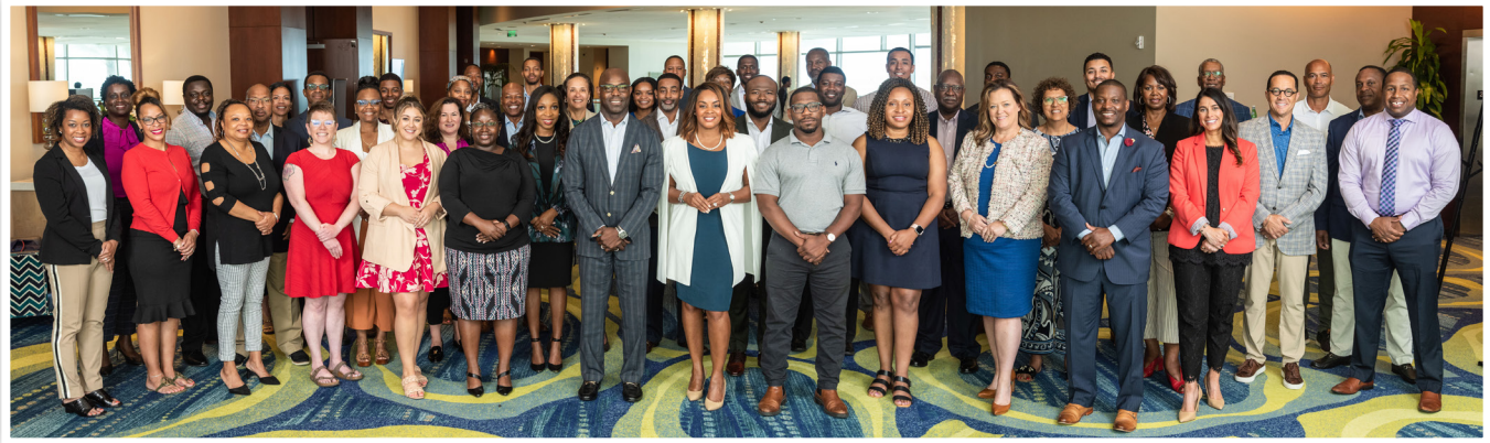
▲ SAY CHEESE: Attendees of the eighth annual BFAN Symposium pose for a group photo at the Opal Sands in Clearwater Beach, Florida.